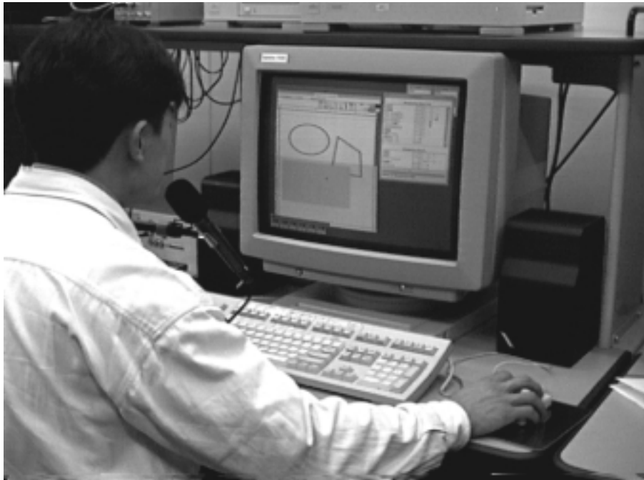
Figure 1: The operation style of S-tgif. The user input commands with speech, while operating key-board with left hand and mouse with right hand.